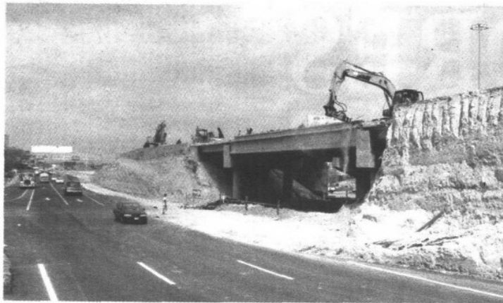
SPECIAL TO THE NEWS